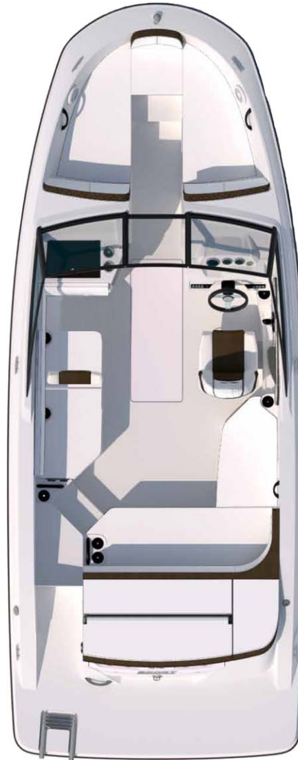
OPTIONAL PORT LOUNGER with convertible backrest