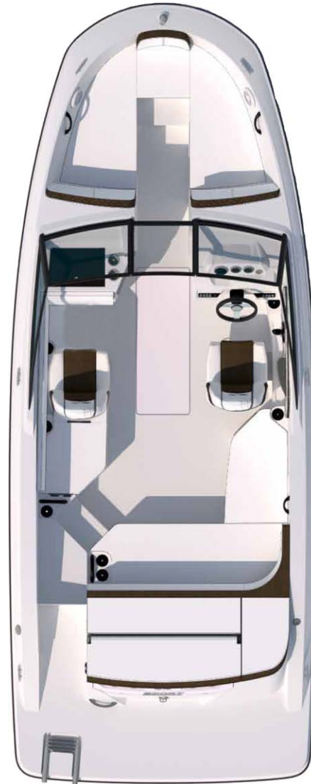
STANDARD PORT BUCKET SEAT